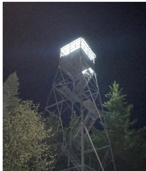
Owl's Head