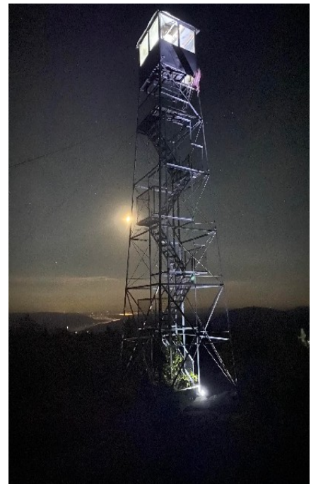
Hadley tower