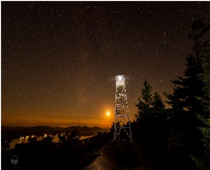
Bald/Rondaxe mountain