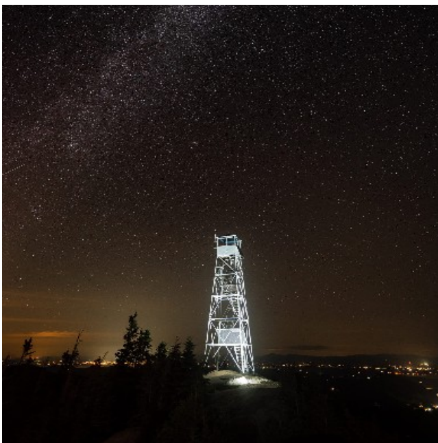
Hurricane by Brad Wenskowski