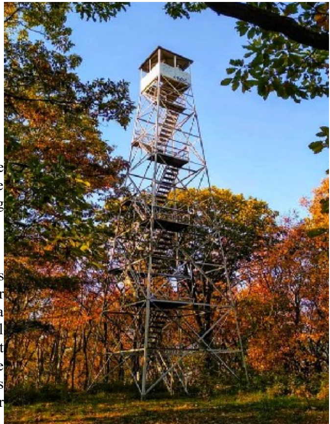
Photo Contest Winner: This month's gorgeous photo and the one with the most likes on our Facebook page was sent in by Cindy Bishop. It is a photo she took in Oct of 2020 of the Beebe Hill Fire Tower. I can see why it got so many votes, it is beautifully framed by the fall foliage and blue sky. Congratulations to Cindy. This photo is featured here and is the new cover photo on our Facebook page until next month's contest!

Fire Tower Closures: Please remember that we are not the only people who enjoy time in the outdoors. Many hours were put in behind the scenes to create easements over private lands that allow us to visit fire towers for many months of the year. Part of the agreement may have been to close the trails over those easements for a short time during hunting season. Your respect for those closures is critical to us keeping the trails open the remainder of the year and to the possibility of future agreements. Fire Tower closures for Swede Fire Tower Trail continue. It will reopen on December 16 th . Stillwater fire tower trail is closed through December 20 th and Spruce Fire Tower trail will close on October 23 rd and remain closed through December 6 th .