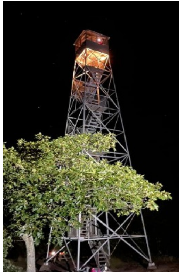
Overlook by Lourdes Senora