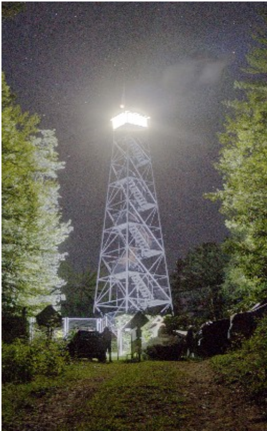
Cornell Hill